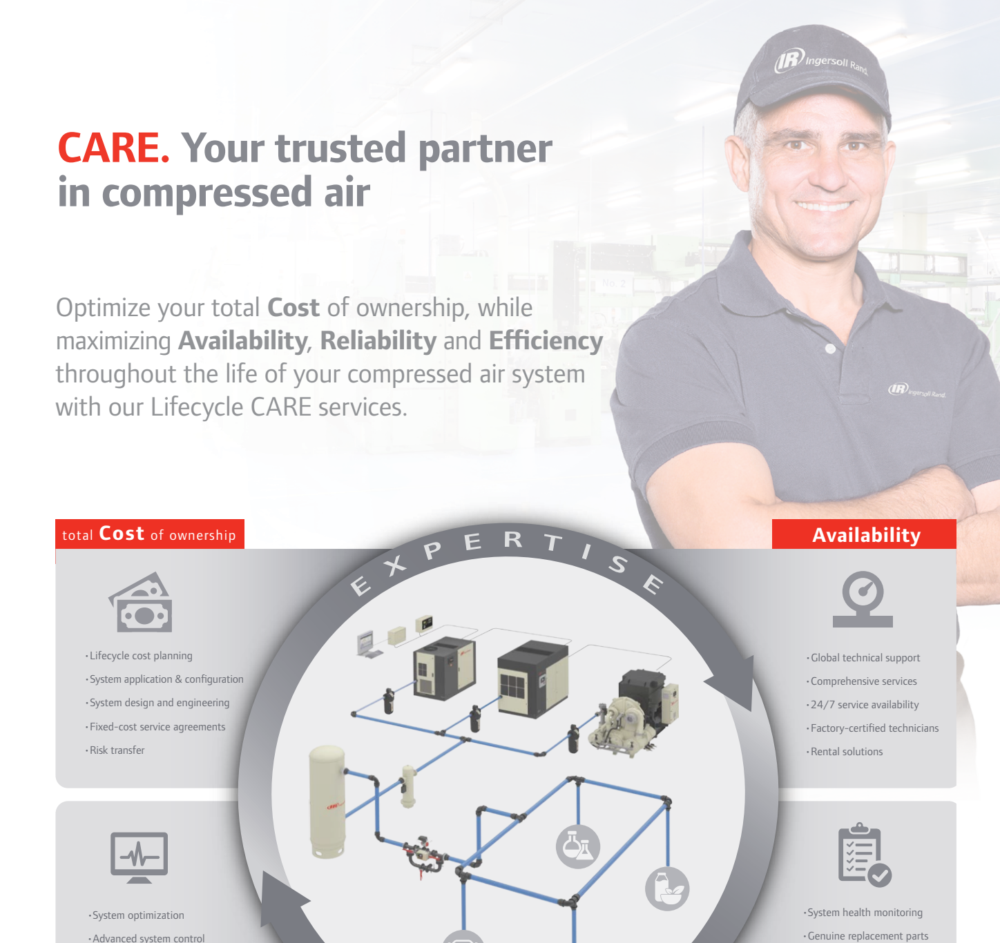
Design Commission Operate Maintain Extend Install