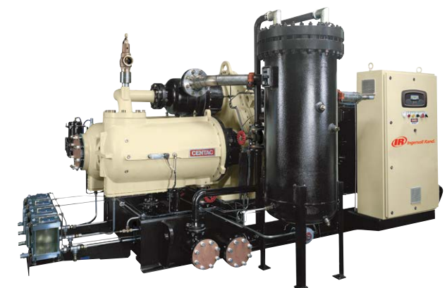
MSG Centac C750