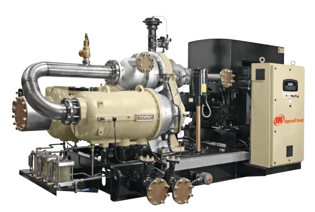
MSG Centac C1050