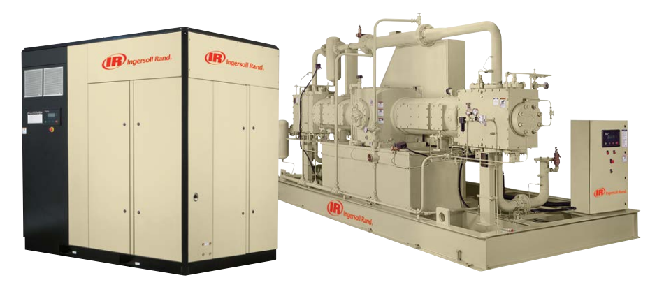
Primary Booster Systems

Specifically configured for your unique application.